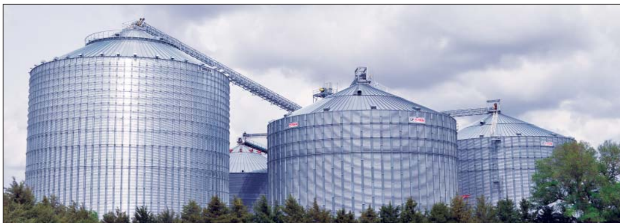
CPI's grain elevator at Ragan, NE. The large tank at far left is a replacement for a tank destroyed in the storm.

And the storm didn't spare the two CPI locations at Campbell (402-756-8291) and Ragan (308-567-2241). At both locations, the storm destroyed a 105-foot-diameter, 750,000-bushel steel tank. Olson notes that the tanks were empty at the time, which made them more vulnerable to the wind.