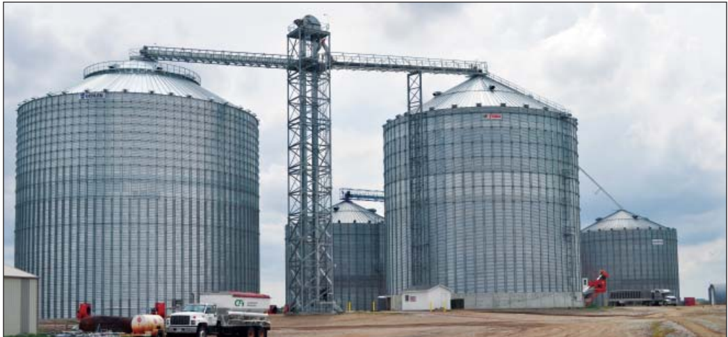
CPI's elevator at Campbell, NE. The large Behlen tank at left was a replacement for a tank destroyed in a windstorm June 14, 2014.

The severe windstorm that blew across south central Nebraska on Father's Day, June 14, 2014, did relatively little damage to the towns of Ragan and Campbell, despite winds clocked at 118 mph. Fortunately, only minor injuries to residents were reported.