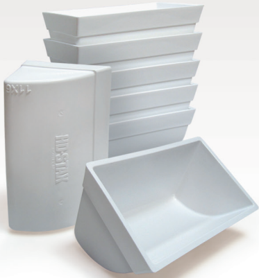
Elevator Buckets (HD-STAX)