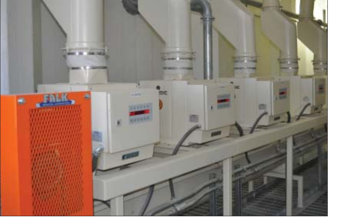
A series of eight Buhler flow controllers route product through the complex flow required for the large variety of animal feeds produced at Casa Grande.

Nevertheless, it's Cargill Animal Nutrition's policy to operate state-of-the-art feed mills whenever possible, so it was time for a replacement.