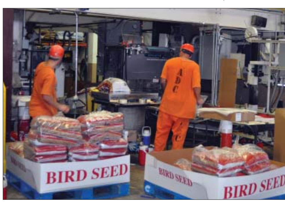
Workers stack bags of bird seed coming out of one of three Thiele bagging lines.