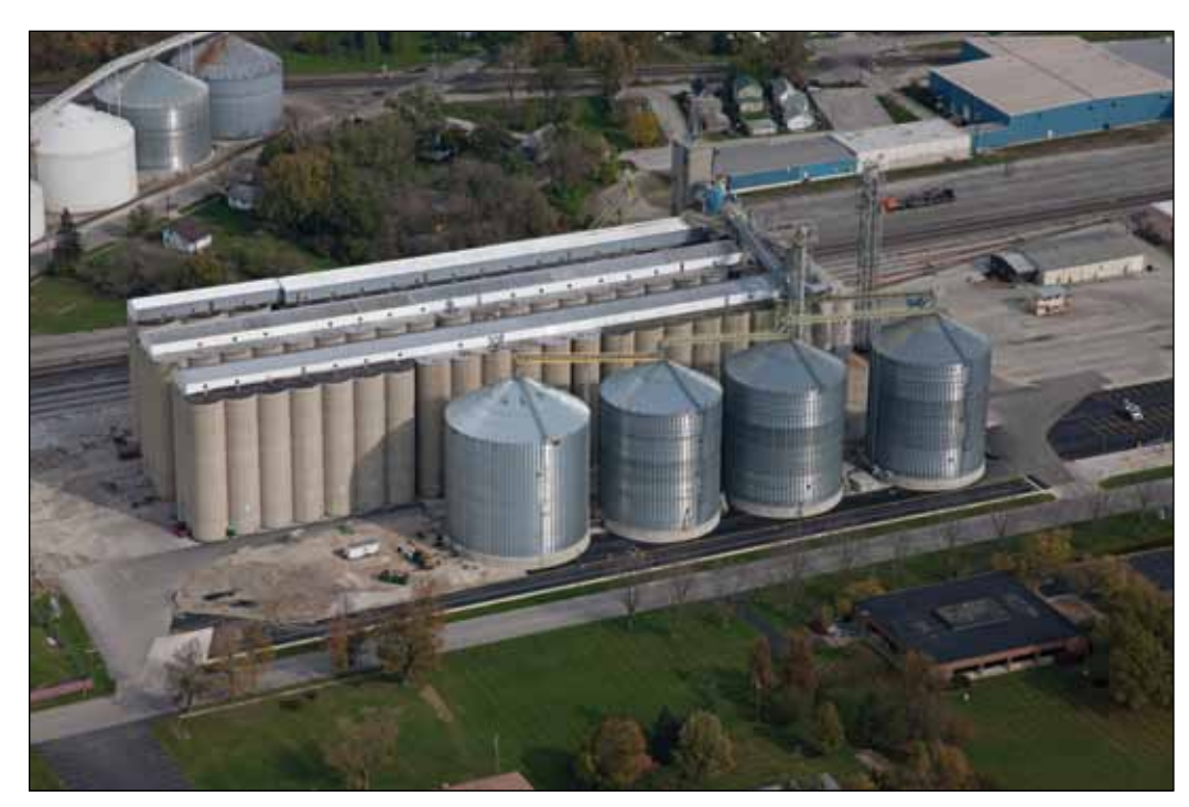
Aerial view of Blanchard Valley Farmers Cooperative's 9-million-bushel-plus grain elevator on the southwest side of Fostoria, OH. The facility's newest corrugated steel tank is visible bottom left.

Millwright..... Elevator Services & Storage, Inc.