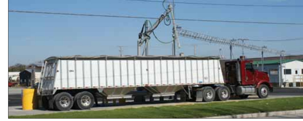
New Intersystems truck probe takes a sample and sends it to the new scalehouse at right via pneumatic tube.

a new 730,245-bushel GSI steel tank at the west end of the row of steel tanks, the fourth steel tank along the southern side of the property.