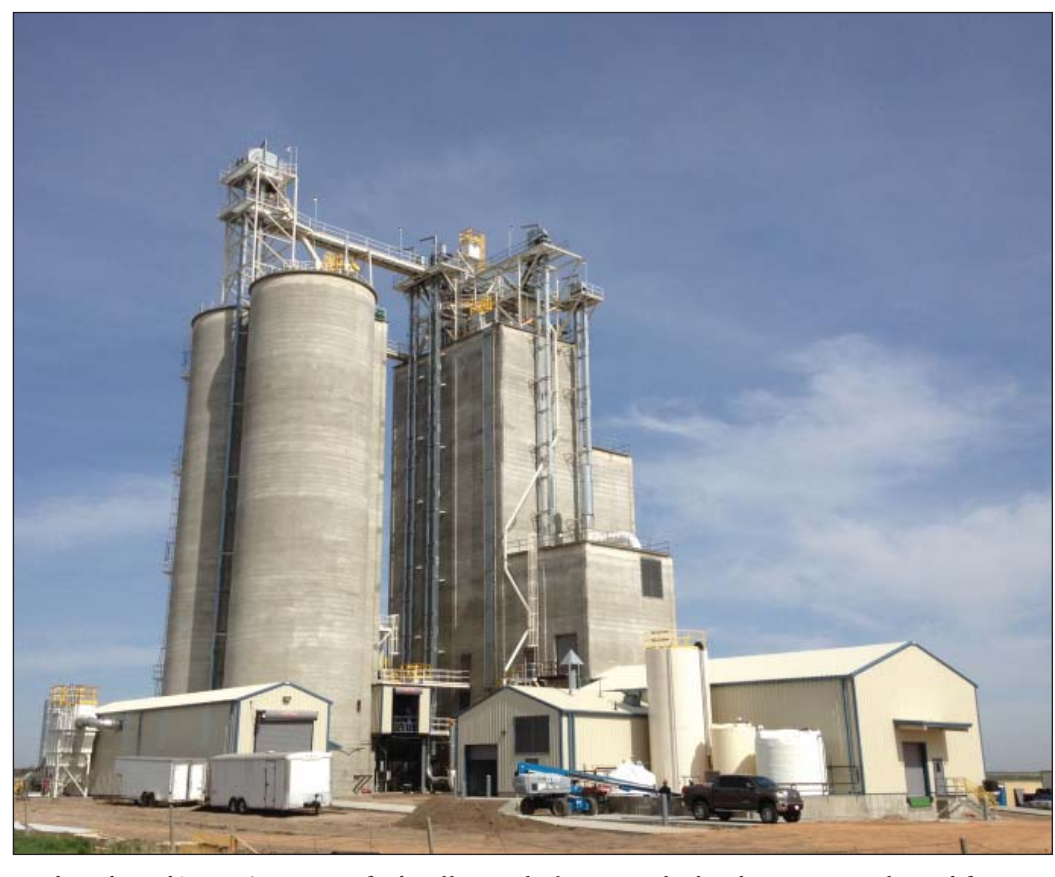
Seaboard Foods' new 4,500-tpw feed mill in Holyoke, CO, which is being primarily used for swine feeds at Seaboard swine farms in the area.

Air compressor..... Gardner Denver Batch control system......CPM Beta Bin level monitors..... Monitor Technologies LLC Boiler ...... Hurst Boiler Bucket elevators...Hayes & Stolz Ind. Mfg. Co. Contractor ...... Todd & Sargent Inc. Conveyors ......Tramco Inc. Distributor.. Hayes & Stolz Ind. Mfg. Co. Inc. Dust collection system......MAC Equipment Elevator buckets ..... Maxi-Lift Inc. Engineering .... Todd & Sargent Inc. Gates and diverters ......Tom-Cin Metals Inc. Hammermills .. Mill Technology Inc. Manlift.....Schumacher Elevator Co. Micro-ingredient system ... Sudenga Industries, Inc. Mixer... Haves & Stolz Ind. Mfg. Co. Motion sensors .. 4B Components Ltd. Pellet cooler ...... Andritz Inc. Pellet mill.....Buhler Inc. Screw conveyors ..... Conveyors Inc. Screw feeders......Conveyors Inc. Truck scale......Rice Lake Weighing Systems