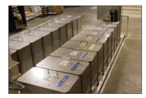
A 20-bin Sudenga microingredient system.

Pelleting is done on a 45-tph Buhler pelleting system. A Buhler conditioner and retentioner adds steam and retention to the mix, before a Buhler Optiflow feeder feeds conditioned mash evenly into the pellet mill. Fat can be added at the die. After pelleting, the feed runs