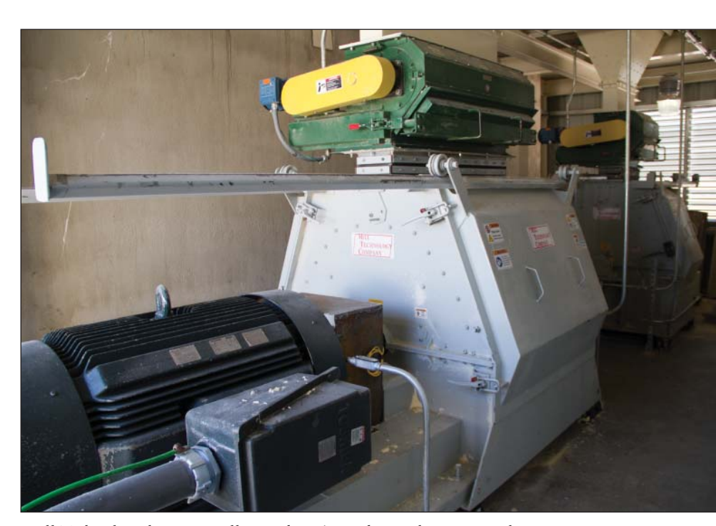
Mill Technology hammermills grind at 40 and 20 tph, respectively.