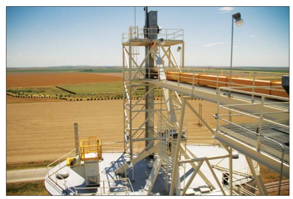
Hayes & Stolz bucket elevator head section and Tramco conveyor system carry received ingredients to a Hayes & Stolz distributor.